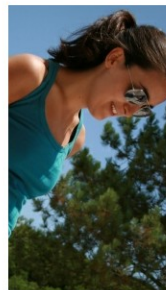
POD CAST DIRECTOR